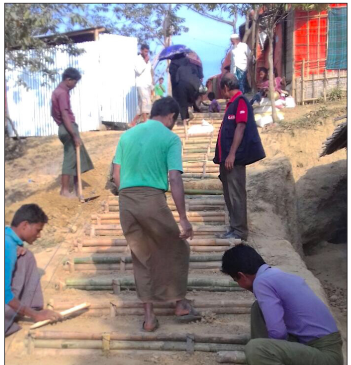
CAID's engineer directs stairway construction in Jamtoli. 68 pathways have been constructed to reduce risk of landslides.

Camp-level unit response team , including GBV and child protection specialists.